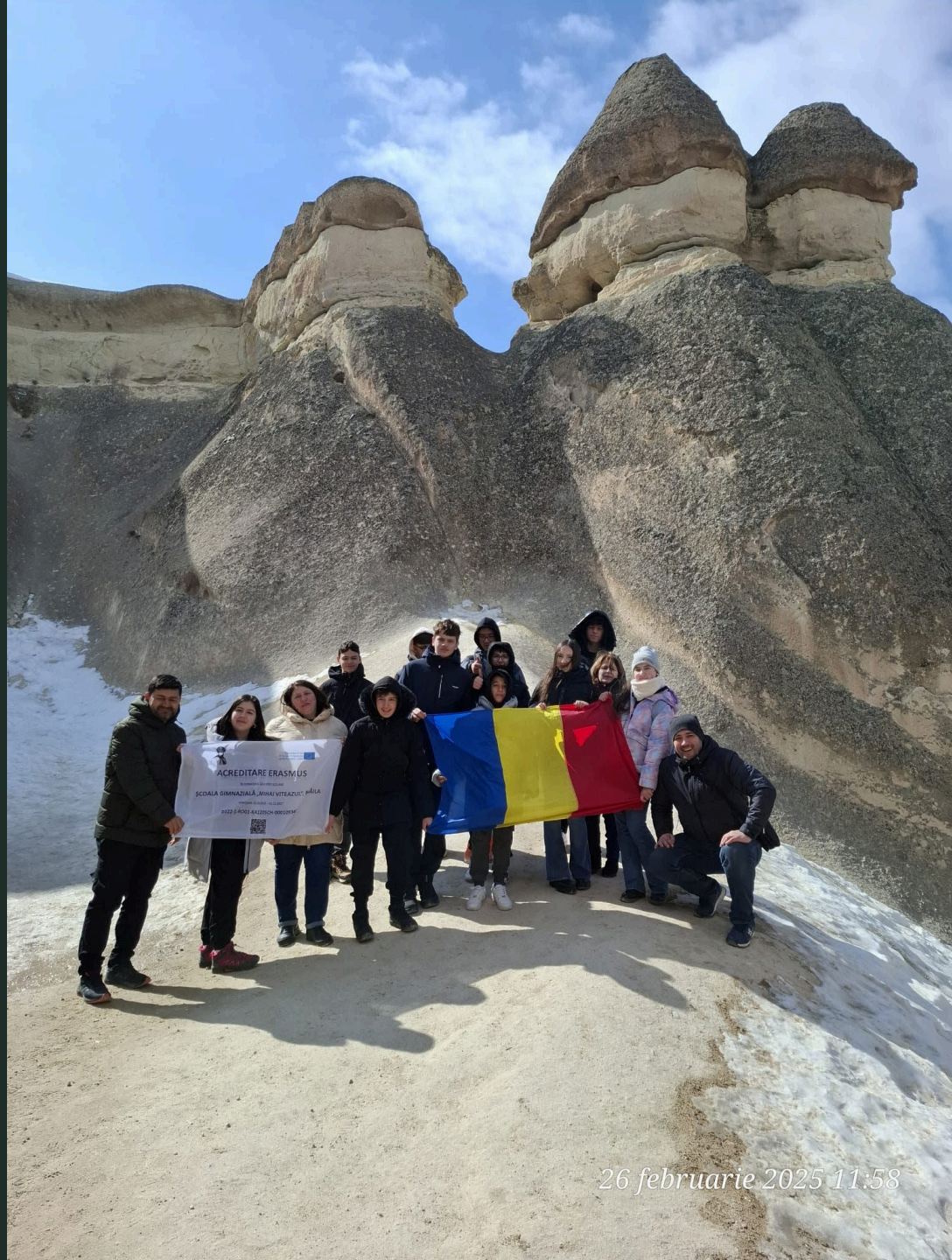
26 februarie 2025 11:58