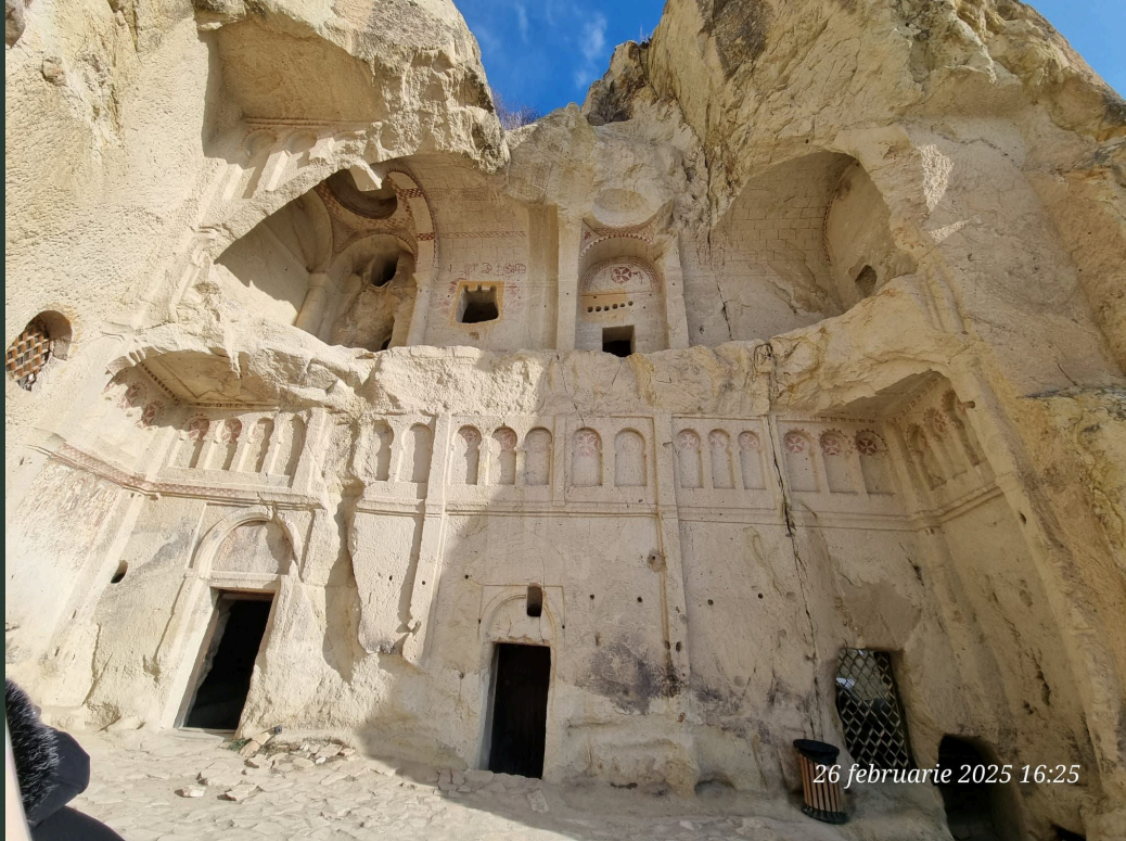
26 februarie 2025 16:25