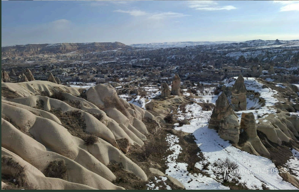
26 februarie 2025 09:58